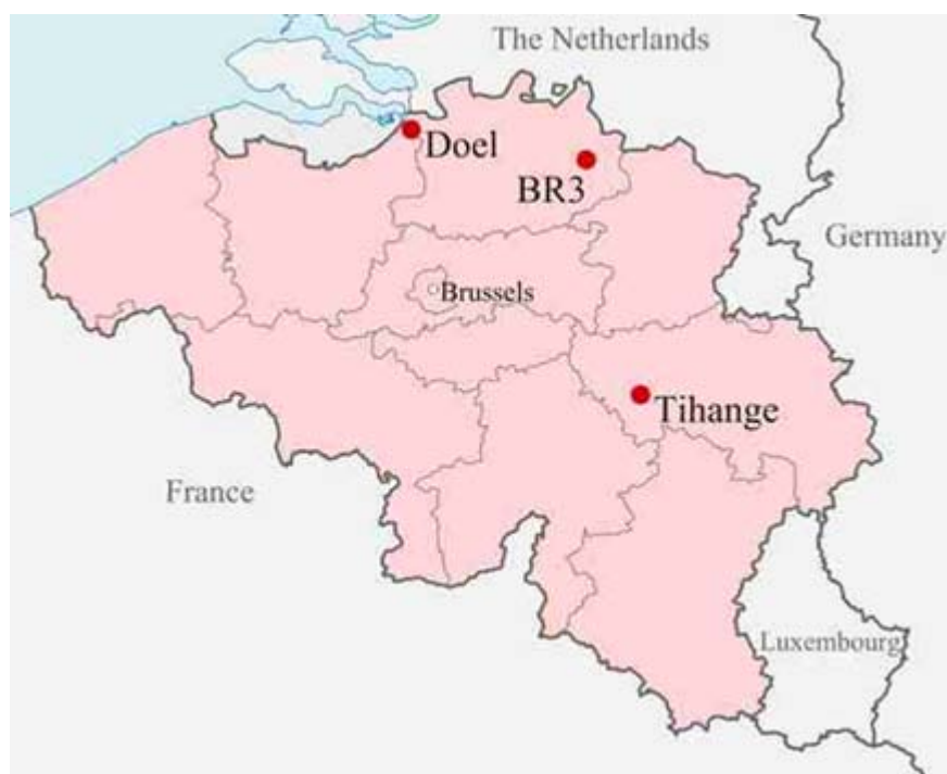
FIGURE 2: Location of nuclear power plants in Belgium) (46) .

The Belgian nuclear power plants are located in Doel (in Flanders) and Tihange (in Wallonia). All are operated by ELECTRABEL, though EDF Belgium owns 50% of Tihange 1 and EDF LUMINUS – a 63,5% subsidiary of EDF Belgium – has a stake of 10,2% in four nuclear units (Tihange 2 and 3 and Doel 3 and 4). ELECTRABEL is a 100% subsidiary of GDF SUEZ S.A.